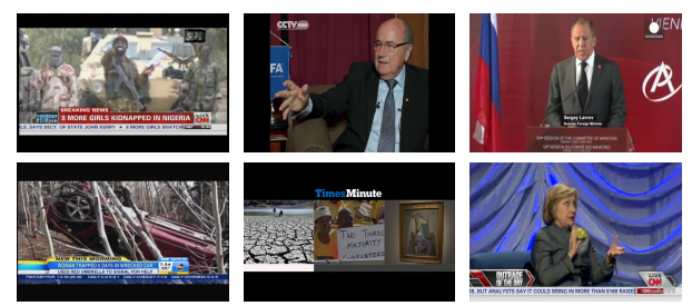
Figure 2: Examples of trending images detected on May 6, 2014.

in the system. This way, our system always indexes news programs from the most recent 10 days.